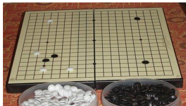
Magnetic Set GSCX2

The above set contains melamine tiles, wind indicator and two dice. There are no Western numerals, and no scoring sticks.