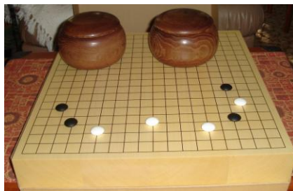
Hiba 5.5cm + chestnut bowls