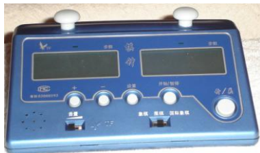
Digital Go Clock